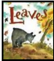
Leaves by David Ezra Stein

Before you read the book to your child, show the cover of the book and read the title and author. Ask your child what he or she thinks the book is about. After reading the book, ask your child the following questions.